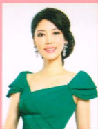
演唱: 方琼 Vocal: Fang Qiong